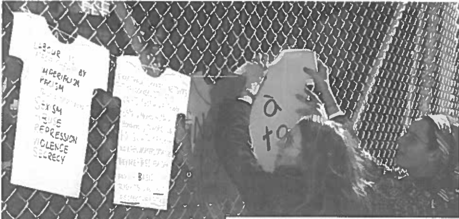
MSN supporters hang anti-sweatshop, anti-FTAA signs on Quebec City's "Wall of Shame."