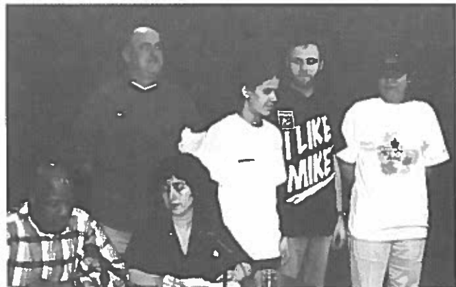
MSN, OPSEU, UNITE and SAS-C members model Ontario government apparel during a press conference announcing an NDP No Sweat private member's bill.

To date, licensing and/or purchasing policies have been adopted at six Canadian universities (Alberta, Western, Guelph, Toronto, Trent and Dalhousie). However, with the exception of Toronto, these policies were adopted codes without consulting students and are not acceptable to local Student Against Sweatshop groups. On these campuses, students are