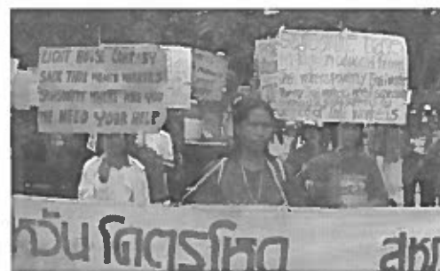
Thailand: LightHouse factory workers protest firings of union leaders

On June 11, 850 Light House factory workers in Thailand held a work stoppage to protest the firing of 20 recently elected union leaders. All the protestors were immediately fired.