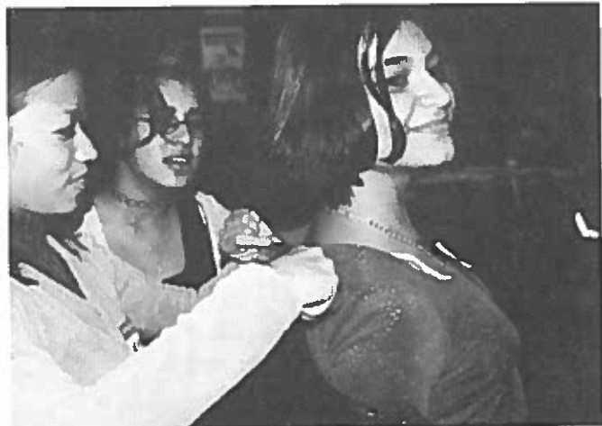
Cut it out: No Sweat activists cut out clothing labels to present to Industry Minister Allan Rock.

According to Hynd, factory disclosure regulations would