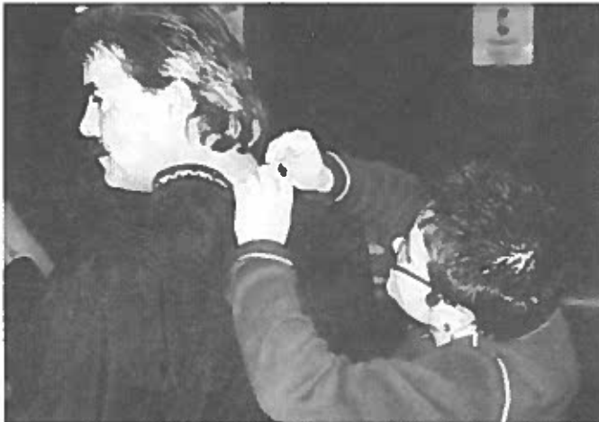
Checking the label: Currently consumers can't tell which factories clothing companies use.

In a recent letter to Industry Minister Allan Rock, the Eastern Association of College Stores (EACS)— an association representing 47 campus stores in Canada — wrote that "EACS supports [ETAG's] recommendation to ensure that apparel manufacturers are publicly linked to factories and workshops in which goods are manufactured... We urge you to make changes to the Textile Labelling Act