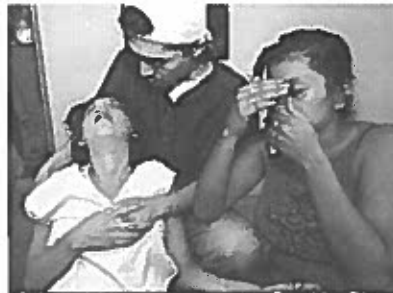
El Salvador: Poisoned workers at Hoon factory

Along with the No Sweat policy, McMaster has also adopted a fair trade coffee policy requiring coffee providers to offer consumers the choice of fair trade coffee at all campus locations.