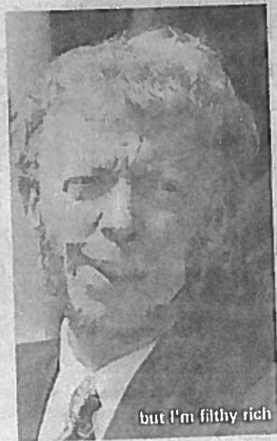
but I'm filthy rich

10 times the 1999 earnings of 55,000 Indonesian Nike workers