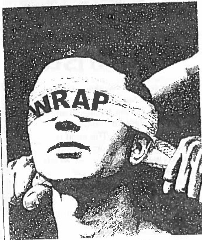
WITH THANKS TO CHUBAWAMBA

Although they are required to pay for the system, Southern manufacturers are also attracted to WRAP, not only by the low standards, but also by the discretion they are allowed