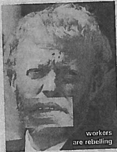
workers are rebelling