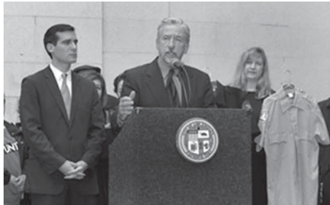
Tom Hayden promoting No Sweat policies

Meanwhile, the City of Los Angeles has provided a $50,000 contract to the Worker Rights Consortium (WRC) to monitor compliance with its No Sweat Ordinance. According to Tom Hayden co-director of No More Sweatshops, this is the first time a North American city has contracted with an outside independent monitoring organization to review its procurement procedures.