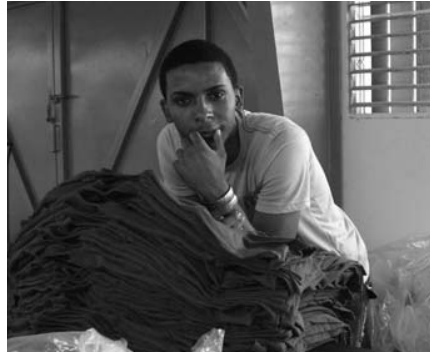
ABOVE: Workers at the AltaGracia factory: decent work and a living wage

The factory, located in the Dominican Republic’s Villa Altagracia Free Trade Zone, employs 130 workers producing t-shirts and hooded sweatshirts and is fully owned by Knights Apparel. At the suggestion of the Worker Rights Consortium (WRC), the company is using the same facility where workers lost their jobs five years ago, when a Nike