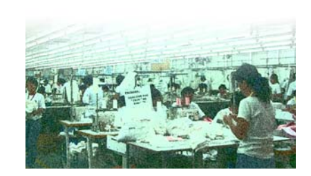
<sup>8</sup> MSN's latest urgent action appeals can be found at www.maquilasolidarity.org/actions/urgentaction

Throughout the year, MSN mobilized participation in urgent action campaigns in support of workers' organizing efforts and for protection of union organizers and human rights activists in Thailand, the Philippines, the Dominican Republic, Honduras, Haiti, Mexico, Costa Rica, Argentina, Bangladesh, and other countries around the world.<sup>8</sup>