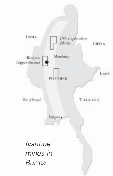
Ivanhoe mines in Burma

Canadian Friends of Burma (CFOB), the CPP has investments in Ivanhoe Mines Ltd, which is involved in a joint venture with Burma's military government, and in CHC Helicopters, a Canadian company that provides transportation services to mining and other industries in Burma. The CFOB is joining with other NGOs and labour groups in demanding an end to all CPP investments in companies doing business in Burma.