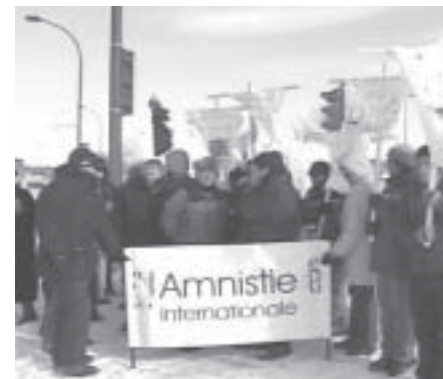
Amnesty International members present petitions outside a Wal-Mart store

In February 2003, the government was flooded with petitions and