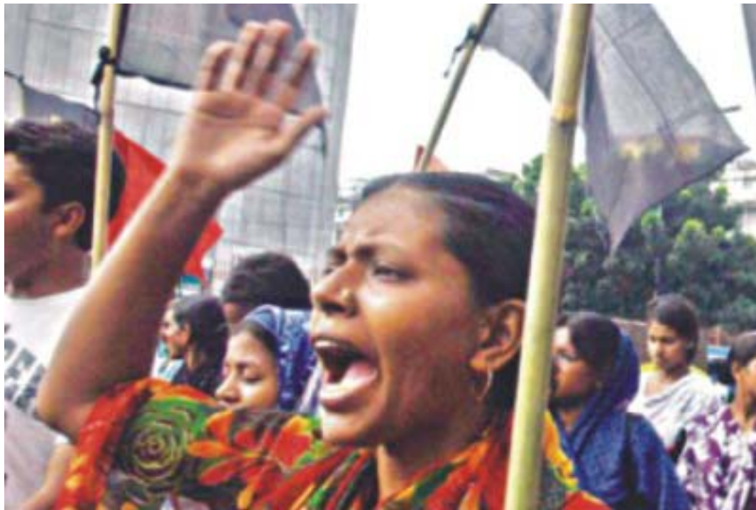
Bangladeshi workers protest