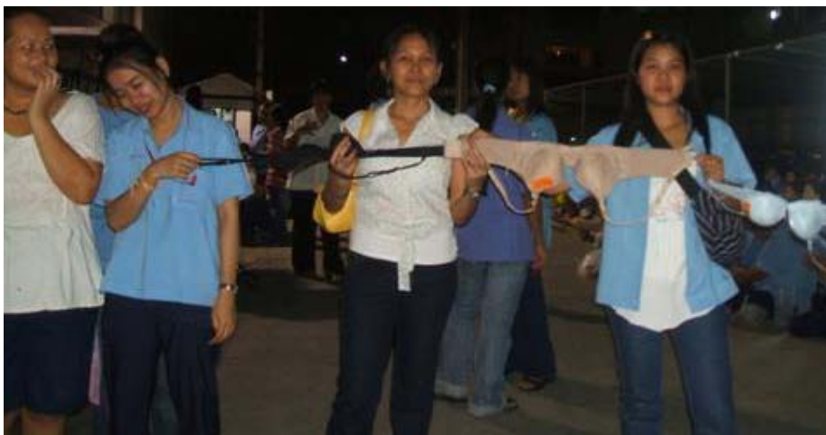
Left: Gina workers protest factory closure