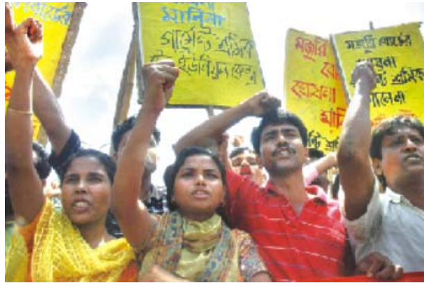
Above and below: Bangladeshi workers take to the streets.

The protesters were later joined by hundreds of workers from a number of neighbouring factories in the area. Reports from the Bangladeshi media