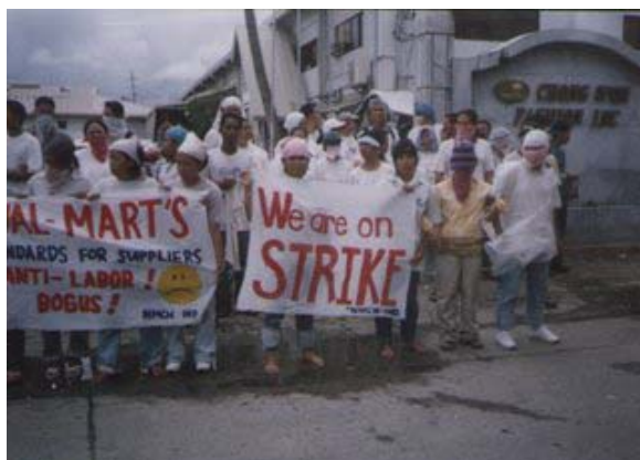
Above: Workers producing Wal-Mart clothing at Chong Won Fashion on strike.

Local union officers reportedly distributed literature to raise worker consciousness, both helping local activists to mobilize fellow workers and meeting with the workers individually to convince them of the benefits of unionization.