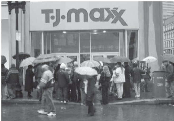
Protesters converge on Sara Lee-owned T.J. Maxx store in Boston

Sara Lee claims its decision to close the factory has nothing to do with workers' attempts to organize, and is part of a broader decision to consolidate production in fewer facilities