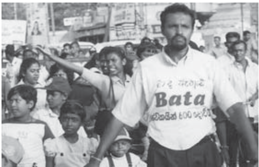
Above: Bata workers and families protest in Sri Lanka

What's so unusual about this case? Not the illegal firings of union members or the company's refusal to reinstate them. What makes this story newsworthy is that the government is actually trying to enforce its labour laws.